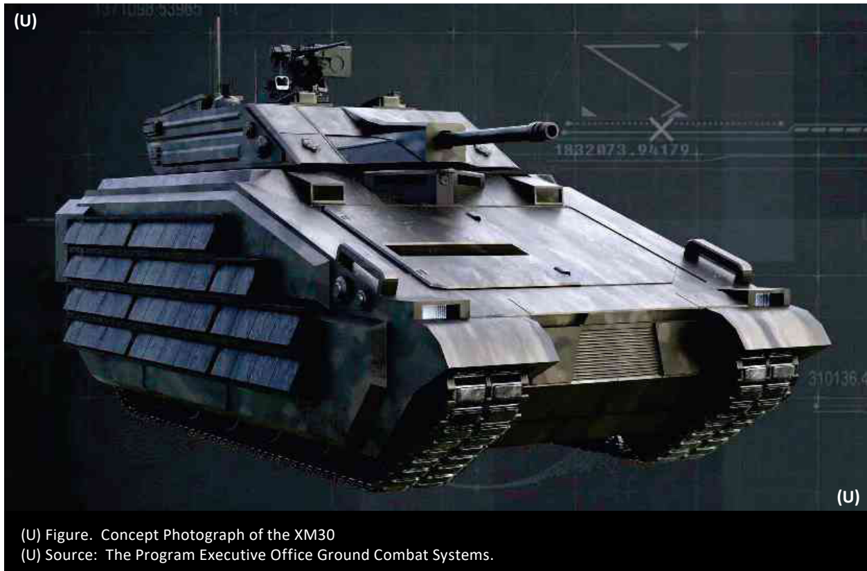
(U) Figure. Concept Photograph of the XM30

(U) As the Bradley's replacement, the XM30 is intended to provide improved protection, firepower, and mobility over the Bradley and include a modular open systems architecture. The modular open systems architecture is expected to allow the Army to take advantage of new technologies and rapidly integrate future hardware and software, ensuring that the XM30 remains relevant for future battlefields. The XM30 is designed to transport and maneuver warfighters to advantageous positions on the battlefield to engage in close combat and deliver decisive lethality. The Figure below is a concept photograph of the XM30.